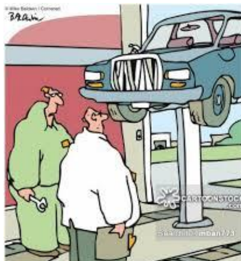
"It's a British car. Needs braces."