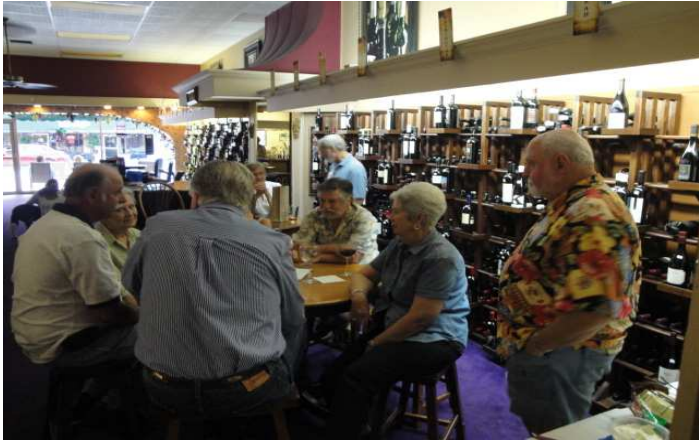
Chatting at the Elusive Grape