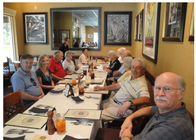
At The Dish for the Lunch

(My apologies to those of you who missed the email about the date change and showed up on July 16. Deland had a car show and a Tropical Nights event on the 16th, and I was afraid the crowds would be too much for us to park and enjoy ourselves.)