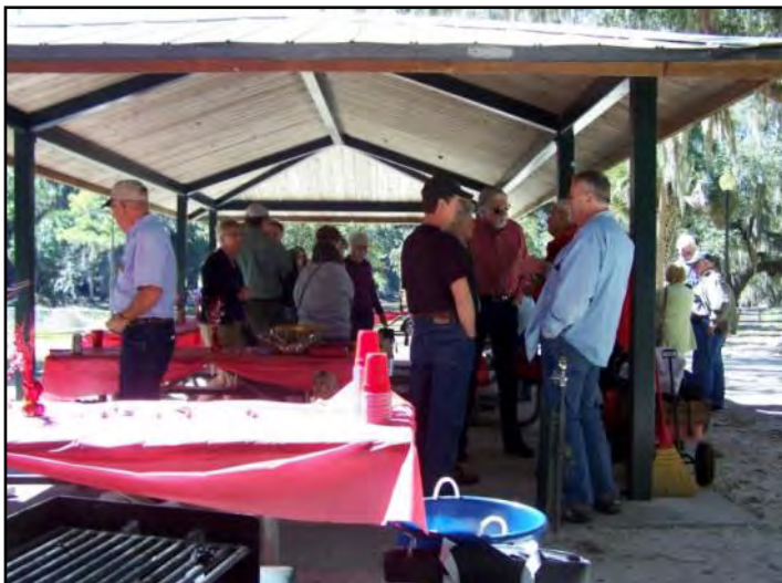
Meeting new friends

True to the club's reputation there was more than enough good food for everyone including those of us that went back for seconds or thirds. Sunday was the first good weather day for a week or so, bringing out a large number of folks taking advantage of the park's amenities. There were a lot of "oohs" and "aahs" over our British cars sitting in the parking lot. Those of you that could not make it try to get by and visit the park, it is one of the many jewels in Volusia County's park system.