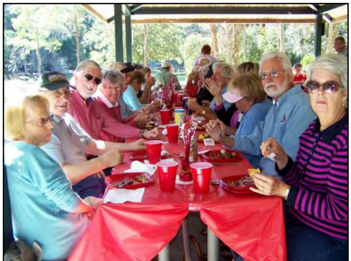
The quietest it has been all day.

True to the club's reputation there was more than enough good food for everyone including those of us that went back for seconds or thirds. Sunday was the first good weather day for a week or so, bringing out a large number of folks taking advantage of the park's amenities. There were a lot of "oohs" and "aahs" over our British cars sitting in the parking lot. Those of you that could not make it try to get by and visit the park, it is one of the many jewels in Volusia County's park system.